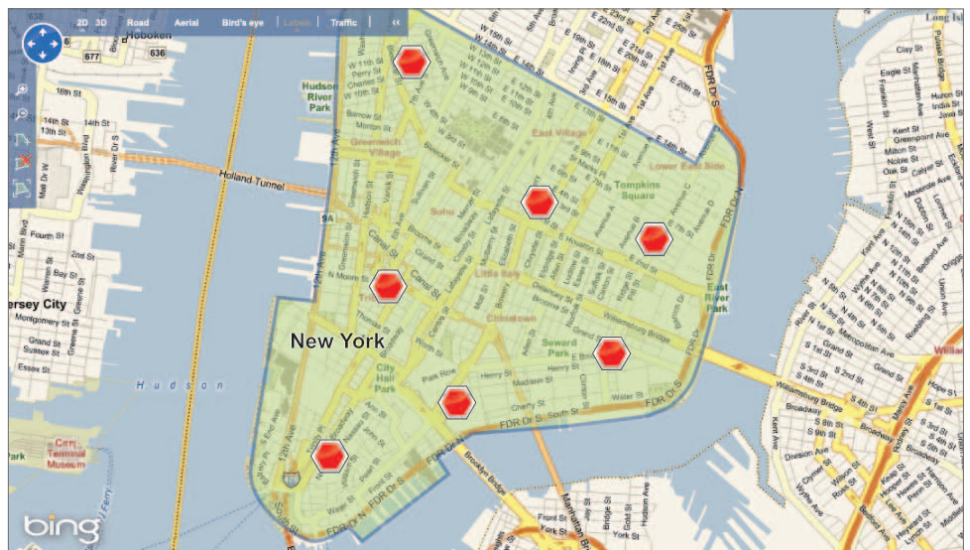
Customer view of IT assets within Absolute Customer Center, with geofencing enabled.

Receive up to $1000, if we are unable to recover your computer.